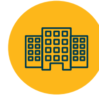
Offices of Physicians