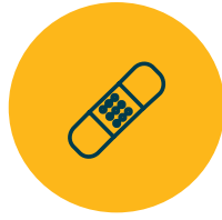
Individual and Family Services