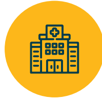
General Medical and Surgical Hospitals