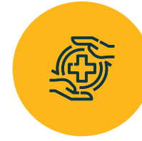
Other Ambulatory Healthcare Services

Career options may require additional experience, training, or other factors beyond the successful completion of an MSN program.