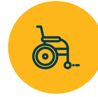
Retirement Communities and Assisted Living Facilities