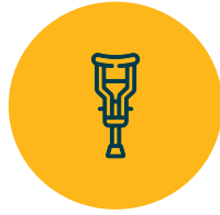
Outpatient Care Centers

Professionals with an MSN degree are sought by employers nationwide in industries such as healthcare, education, and insurance.