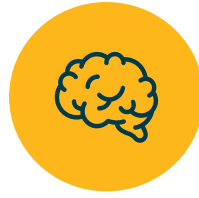
Psychiatric and Substance Abuse Hospitals