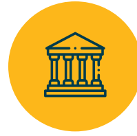
Colleges, Universities, and Professional Schools